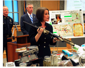
Main Line Drug Ring Charges